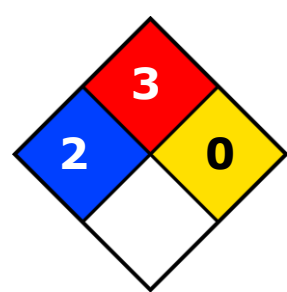
NFPA® 704 CODES

Approximate HMIS and NFPA Risk Ratings Legend: